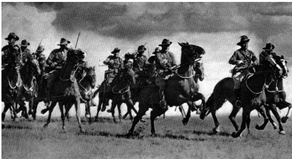
The Australian 4th Light Horse Brigade charge at Beersheba 31 October 1917

The Hervey Bay RSL Sub-Branch will hold a Commemoration Service at the War Memorial in Freedom Park, Main Street, Pialba Commencing at 10:45am