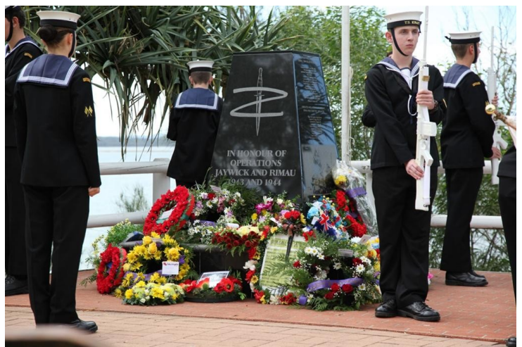
TS Krait Cadets as catafalque party during the Rimau Commemoration at Dayman Park