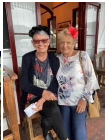
The Women's Auxiliary enjoyed a day out at the Theebine Pub for the 2022 Melbourne Cup

Don't forget to visit our webpage for all the latest Sub-Branch news. www.herveybayrslsubbranch.com.au