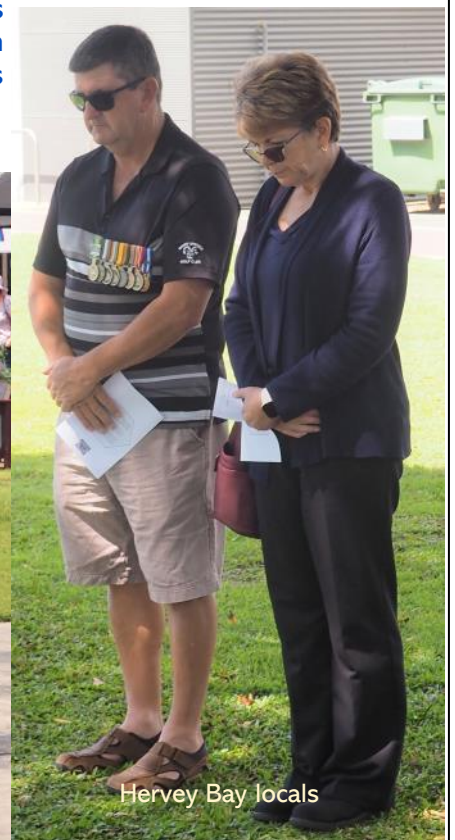
Hervey Bay locals