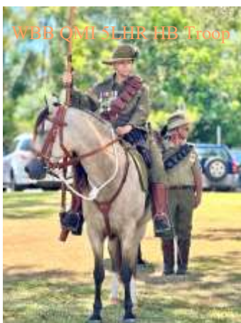
WBB QMI 5LHR Troop