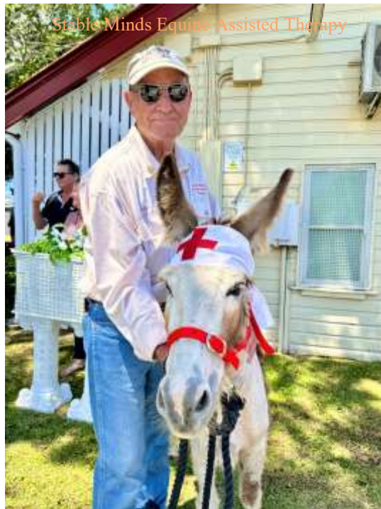
Stable Minds Equine Assisted Therapy