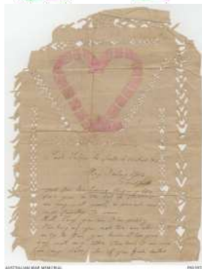
Original hand-written letter decorated with love heart.

Volunteer transcribers will join the project team at the official launch to be held at the Australian War Memorial on 14 February 2024 at 9am. The project was developed with the assistance of the Australian War Memorial's partner, Leidos Australia. To register an interest in volunteering, visit the Australian War Memorial's website .