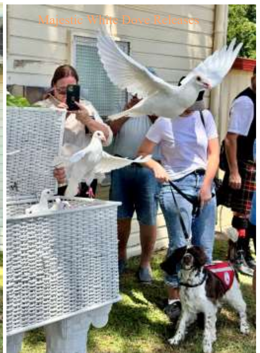
Majestic White Dove Releases