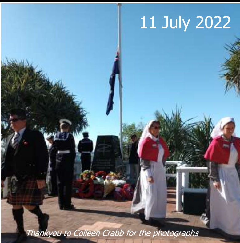
Thankyou to Colleen Crabb for the photographs